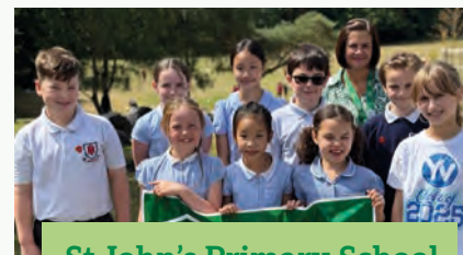
St John's Primary School

Thank you to St John's Primary School , who have raised £809.51 . They got creative and made the longest trail of coins they could, thanks to pupils and staff bringing in £1 and £2 coins. A big well done to everyone for taking part and for their fundraising efforts!