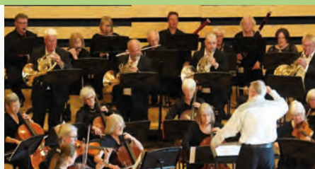
Cranbrook Symphony Orchestra

The Cranbrook Symphony Orchestra is a friendly group who meet once a week and perform wonderful concerts throughout the year. Back in June, one of their concerts in Benenden raised an amazing £538.30 for the Hospice.