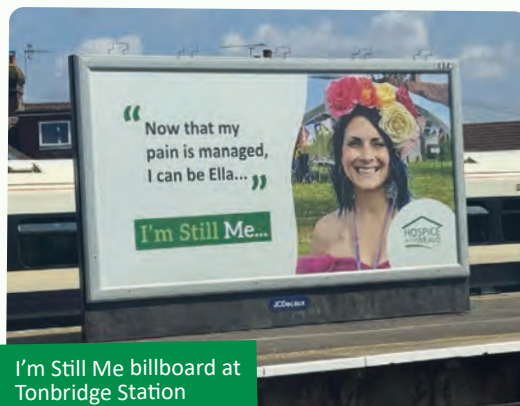
I'm Still Me billboard at Tonbridge Station

Running from late June to August this year, I'm Still Me used real stories and visuals to spread awareness of the reality of hospice care. Through bold billboards, social media posts and more, it hoped to increase understanding of hospice care, highlighting the people at its centre.