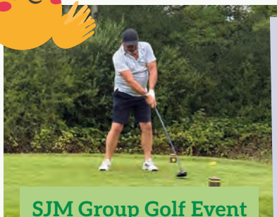
SJM Group Golf Event

A huge thanks to the SJM Group who held their golf event at Nizel's Golf and Country Club at the end of June. They host an annual golf event in support of the Hospice, a cause close to their hearts. This year they raised an incredible £4,700 , taking their overall total over the years to over £15,000!