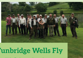
Tunbridge Wells Fly Fishing Society

The Cranbrook Symphony Orchestra is a friendly group who meet once a week and perform wonderful concerts throughout the year. Back in June, one of their concerts in Benenden raised an amazing £538.30 for the Hospice.