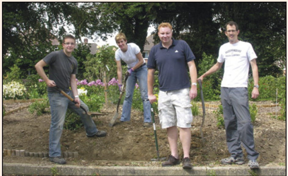
A team from Clydesdale Bank putting new edging to the Hospice garden

Clydesdale Bank organised golf tournaments during the summer