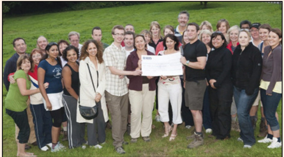
Staff from Thomson Snell and Passmore present a cheque; they walked from their offices in Tunbridge Wells to Sevenoaks

Local (and some not so local) businesses play their part in supporting the Hospice in so many different ways. In this special publication we explain how we work with the business sector so that the Hospice and the company both get the maximum benefit from the partnership. We are also taking the opportunity of saying thank you to those who have helped us during 2009 and hope this will inspire you to support us during our 30th Anniversary Year.